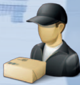
Deliveries & Tracking