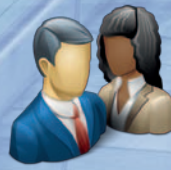
Customers & Suppliers